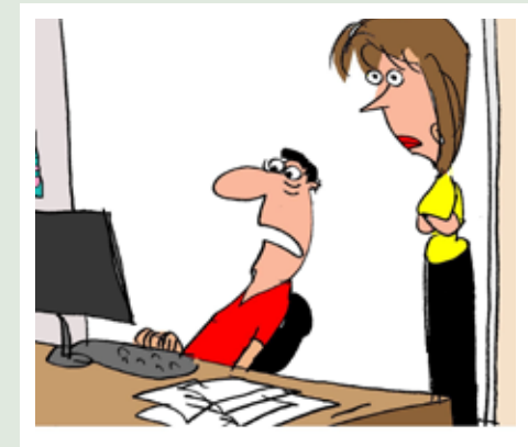
"'Unexpected error.' It stopped being 'unexpected' after the first 10 times it happened."